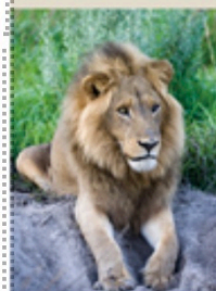
A male lion.

In Asia, lions disappeared later. They lived in Palestine until the Middle Ages (around 500 AD) and they disappeared from the rest of central Asia after the arrival of firearms in the eighteenth century. Between the late nineteenth and early twentieth