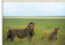
A male and a female lion.

Lions became extinct in America about 10,000 years ago, but 2,500 years ago they were common in Eastern Europe, the Middle East and Asia, as well as most of Africa. However, the European population of lions soon started decreasing. Aristotle, a Greek philosopher , reported that they were rare in 300 BC. By the tenth century , the last European lions had disappeared from their home in the region near Georgia and Armenia.