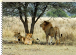
Lions sheltering from the sun.

Most people think that lions live in Africa, so it may surprise you to learn that lions live in India too. In fact, until 10,000 years ago, lions lived all around the world. They were found in most of Africa, across Eurasia from Western Europe to India, and in the Americas from the Yukon to Peru. Among land mammals , only humans lived in more places than lions.